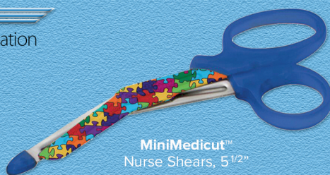
MiniMedicut™ Nurse Shears, 5 1/2"