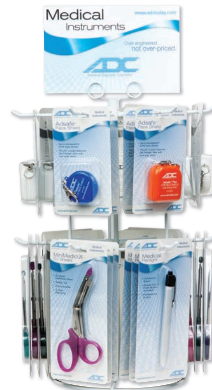
12" X 17" COUNTER SPINNER (COUNTERSPIN)