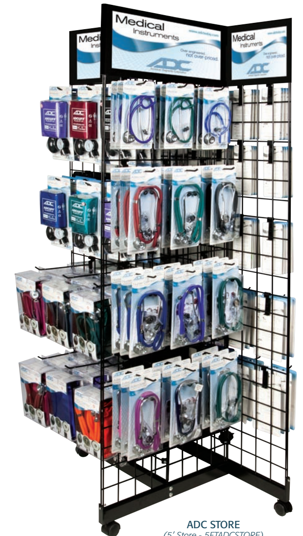
ADC STORE (5' Store - 5FTADCSTORE) (6' Store - 6FTADCSTORE)